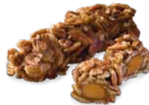
72007 Vanilla Pecan Roll