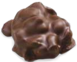
70018 Peanut Cluster