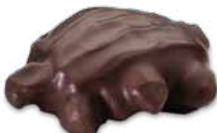
71030 Pecan Pokie