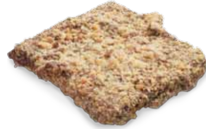
70027 Old Tyme Toffee large milk chocolate toffee square with almonds