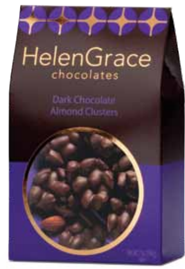
Dark Chocolate Almond Clusters – 7 oz.