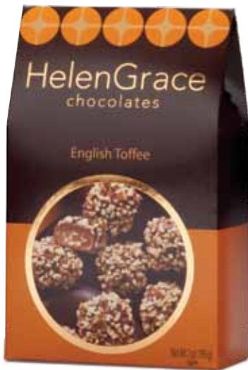
English Toffee – 7 oz.