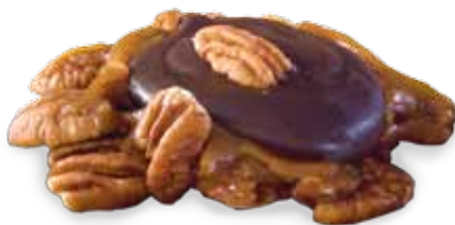
71014 Dark Chocolate Pecan