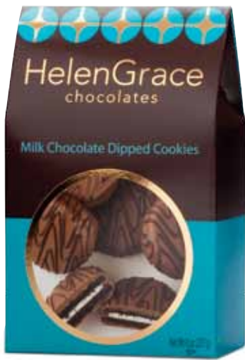
Milk Chocolate Dipped Cookies – 8 oz.