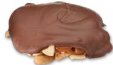
70062 Milk Chocolate Caramel Cashew