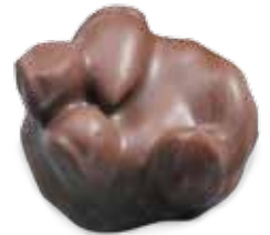
70016 Almond Cluster