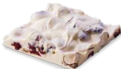
72025 White Coating Cranberry Almond