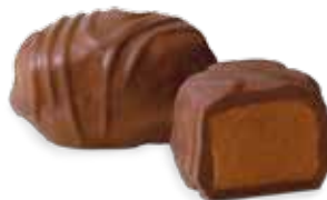
70003 Chocolate Butter Cream