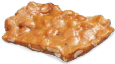
72009 Peanut Brittle