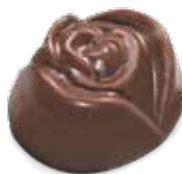
70030 Raspberry Rose Truffle