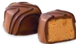
70006 Peanut Butter Cream