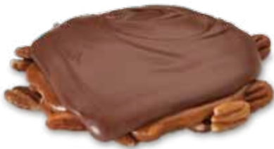
70022 Milk Chocolate Pecan