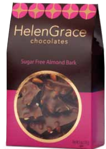
Sugar Free Almond Bark – 6 oz.