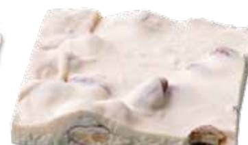
72500 White Coating Almond 74009 Sugar Free White Coating Almond Bark