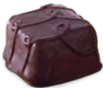
71013 Butter Caramel