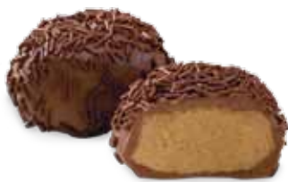
70001 Mocha Cream