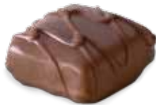
70019 Toffee Square