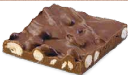
70063 Milk Chocolate Almond