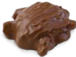
70014 Pecan Pokie