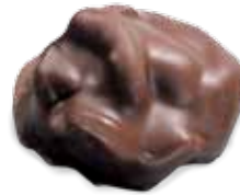
70015 Walnut Cluster