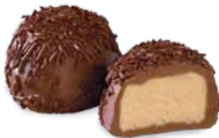
70002 Opera Cream