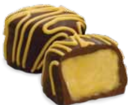
71005 Lemon Cream