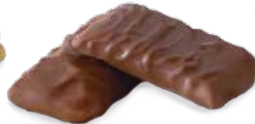
70021 Molasses Chip