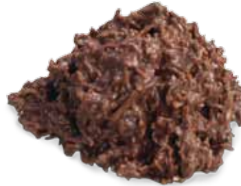
70026 Haystax milk chocolate with coconut