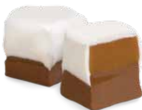
72011 Ultimate Truffle Milk chocolate truffle, caramel and white confection