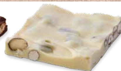
72006 White Chocolate Almond