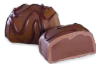
70059 Dark Mint Truffle Center