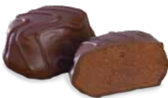
71002 Chocolate Butter Cream