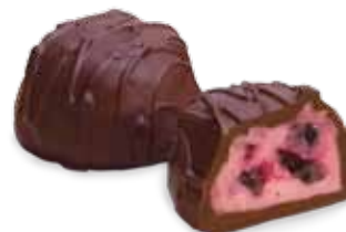
71034 Blueberry Cream