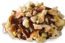
70020 English Toffee