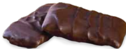
71015 Molasses Chip