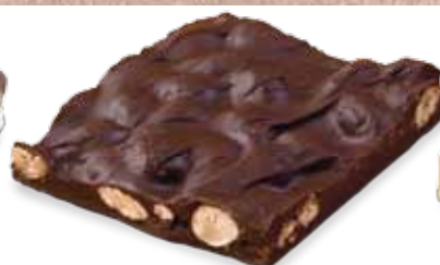
71032 Dark Chocolate Almond