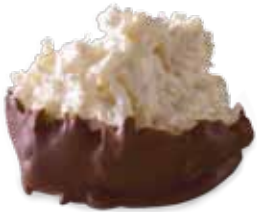
72046 Haystax double dipped white coated coconut dipped in milk chocolate