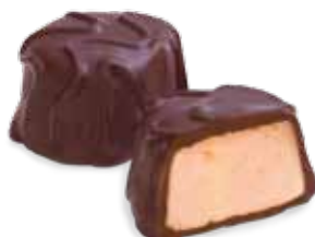
71033 Orange Cream