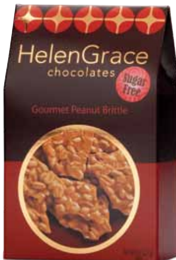
Sugar Free Gourmet Peanut Brittle – 8 oz.