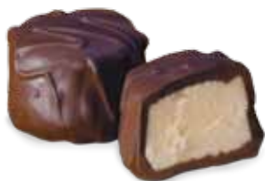
71001 Vanilla Butter Cream