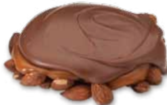
70023 Milk Chocolate Almond