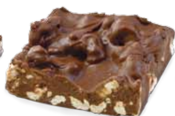
70068 Milk Chocolate Rocky Road