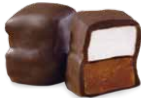
71035 Dark Chocolate Caramel and Marshmallow