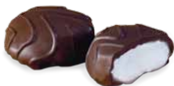
71021 Peppermint Cream