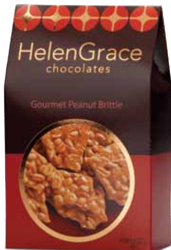
Gourmet Peanut Brittle – 8 oz.