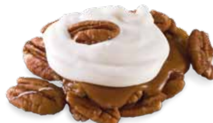
72048 White Confection Pecan