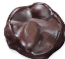
71017 Almond Cluster