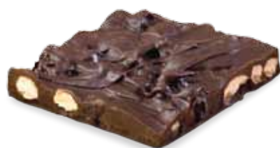
71036 Dark Chocolate Blueberry Almond