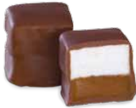
70067 Milk Chocolate Caramel and Marshmallow