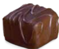
71003 Meltaway Truffle Center