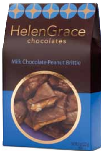
Milk Chocolate Peanut Brittle – 8 oz.