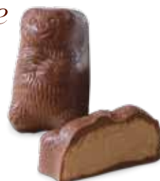
70031 Peanut Butter Bear Truffle