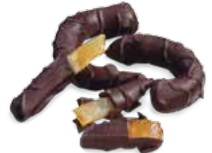
71020 Dark Chocolate Hand-Dipped Orange Peel