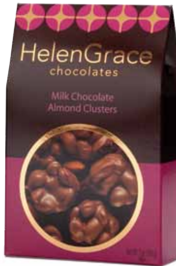
Milk Chocolate Almond Clusters – 7 oz.