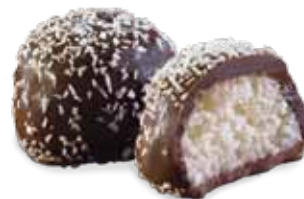
71008 Coconut Cream