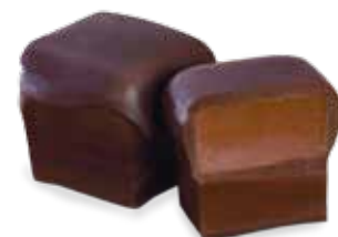
72028 Truffle Deluxe Dark chocolate truffle, caramel and dark chocolate