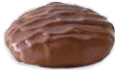
70013 Vanilla Caramel