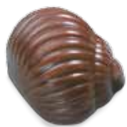
70028 Belgian Truffle