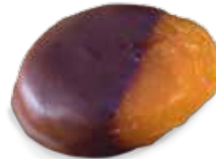
71019 Dark Chocolate Half-Dipped Apricots