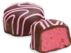
71004 Boysenberry Cream