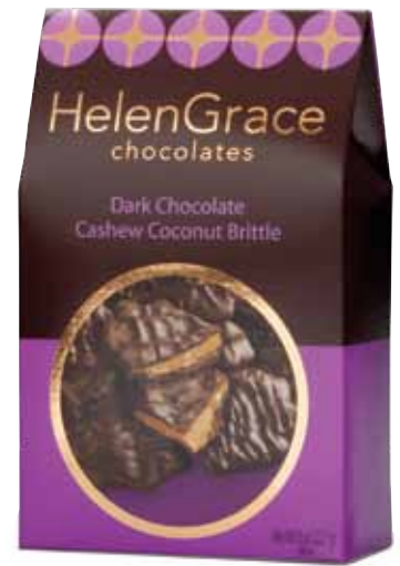
Dark Chocolate Cashew Coconut Brittle – 8 oz.