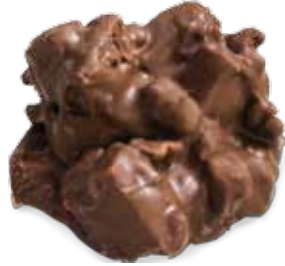
70025 Rocky Road milk chocolate, marshmallow, walnuts