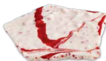
72026 White Coating Peppermint