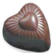
70029 Cappuccino Heart Truffle