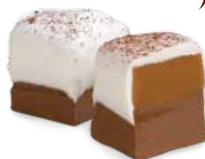
72027 Caramel Macchiato Milk chocolate coffee-flavored truffle, caramel and white confection