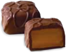
70012 Butter Caramel